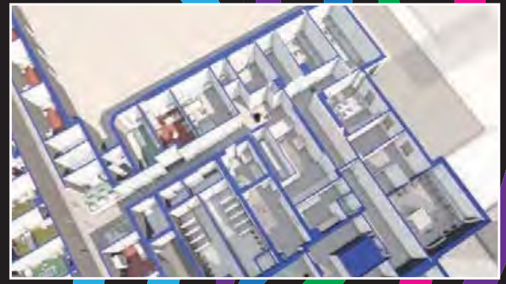
Overhead Image of ITM CRF (Impressions from 3D flythrough)