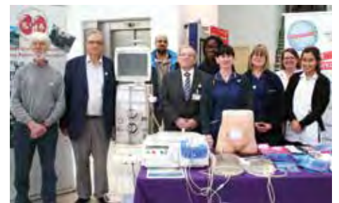
Campaigners raising awareness of kidney disease

QEH Kidney Patients' Association. The QEKPA provides renal patients with a voice and raises money through donations and various sponsored events, largely organised by patients' relatives.