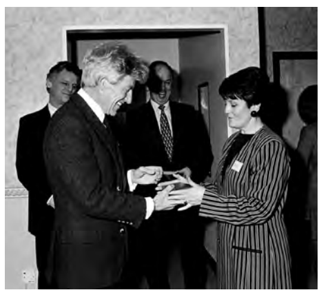
Official opening, December 1995

"I'd love to visit the new unit. At least with lots of TVs, there will be no fights over the remote!"