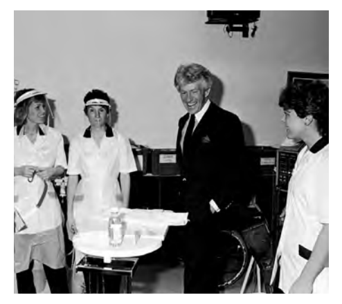
Lord Lichfield meets staff